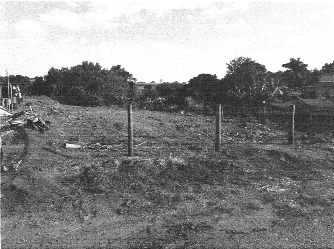
QUADRO 06 LOTE 02